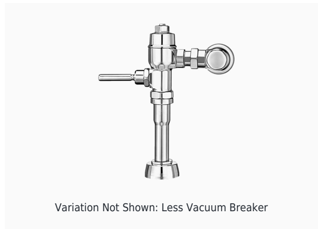
Variation Not Shown: Less Vacuum Breaker